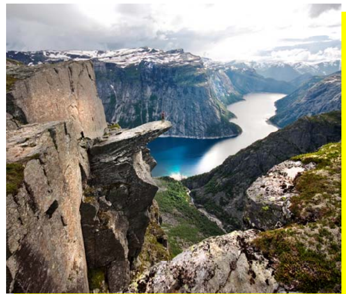
Trolltunga i solnedgang