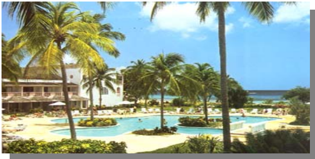
St. James Barbados, W.I.