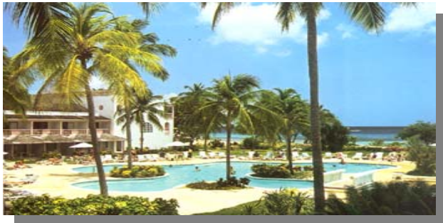
St. James Barbados, W.I.